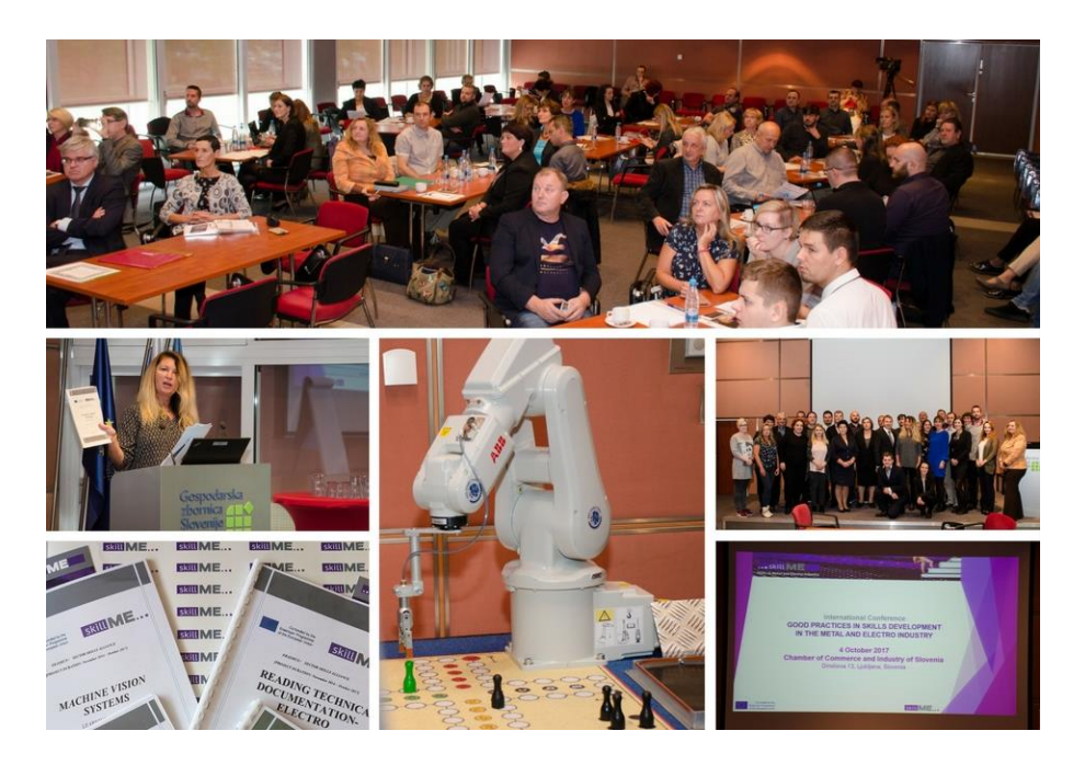
The international skillME conference was hosted on 4 October 2017 in Ljubljana, Slovenia.

The purpose of the conference was to present good practices and innovative approaches in filling skill gaps, matching skills with labour market needs, developing new skills for new jobs and adapting national strategies in order to improve the quality and efficiency of vocational education and training and increase the competitiveness of workers. Various approaches to strengthening VET in the participating countries of Slovenia, Slovakia, Latvia and Croatia and national strategies for implementing the curricula designed within the skillME project into national VET frameworks have been presented. In addition, trainers and students presented their concrete experience with pilot trainings implementation and demonstrated the usability of the trainings and results based on the Machine Vision training – camera usage for robot control, presented by students of the Secondary Technical School Stará Turá. More information on the conference can be found on the <u>project website</u>.