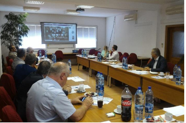
Croatian National skillME Conference 29 September 2017, Zagreb (Croatia)