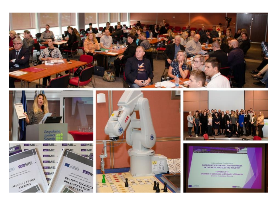
The international skillME conference was hosted on 4 October 2017 in Ljubljana, Slovenia.

The purpose of the conference was to present good practices and innovative approaches in filling skill gaps, matching skills with labour market needs, developing new skills for new jobs and adapting national strategies in order to improve the quality and efficiency of vocational education and training and increase the competitiveness of workers. Various approaches to strengthening VET in the participating countries of Slovenia, Slovakia, Latvia and Croatia and national strategies for implementing the curricula designed within the skillME project into national VET frameworks have been presented. In addition, trainers and students presented their concrete experience with pilot trainings implementation and demonstrated the usability of the trainings and results based on the Machine Vision training – camera usage for robot control, presented by students of the Secondary Technical School Stará Turá. More information on the conference can be found on the project website.