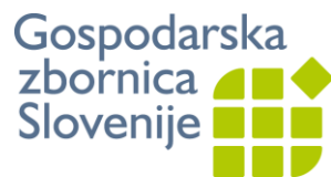
Metal Processing Industry Association