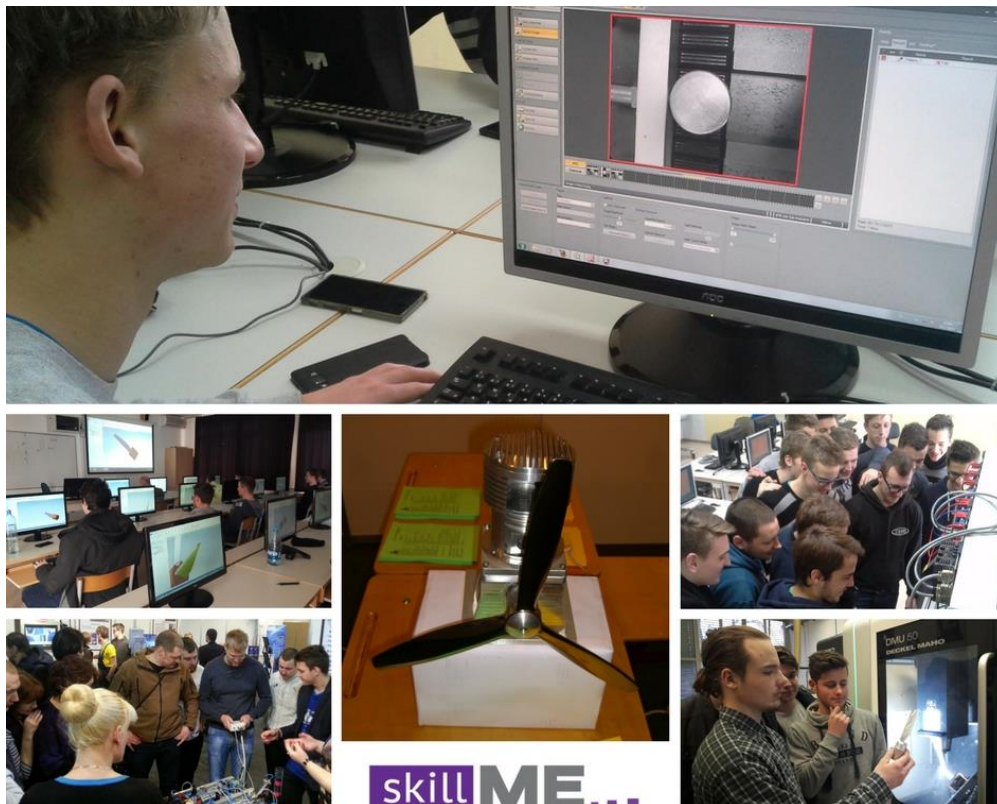
SkillME Pilot trainings implemented in Croatia, Latvia, Slovakia, and Slovenia

In September 2017 , the project partner overseeing pilot trainings implementation, Riga Technical College from Latvia, will prepare a Final Pilot Training Report summarizing all piloting activities implemented on the national level, focusing on the impact of the trainings and recommendations for future activities.