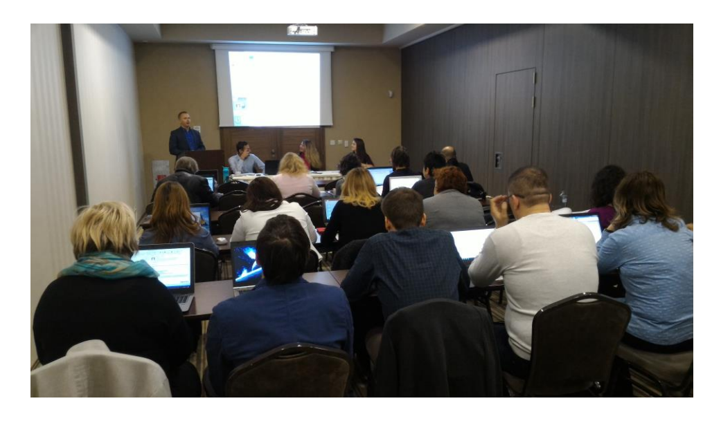
skillME project partnership, 6th partners' meeting in Slovakia, 9-10 May 2017

On 9 and 10 May 2017 , project partners organized the 6 <sup>th</sup> project partners' meeting in Liptovský Mikuláš, Slovakia, which was hosted by the Slovak project partner ZEP SR — Association of the Electrotechnical Industry of the Slovak Republic . The focus of the meeting was the presentation of finalized, ongoing and future project activities primarily connected with pilot trainings implementation . VET partners presented the results and findings and tried to evaluate the functionality and adequacy of the implemented curricula.