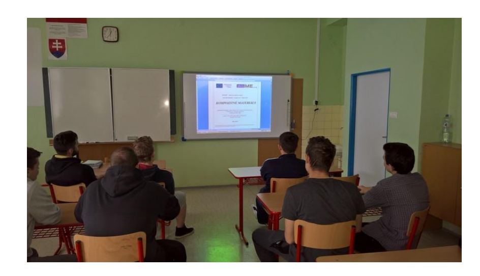
skillME pilot trainings in Slovakia

In Slovakia, pilot training activities were implemented at the project partner school SOŠ Stará Turá and attracted school SOŠIT Bratislava from January to May 2017 after previous studying and preparing materials for teaching and training.