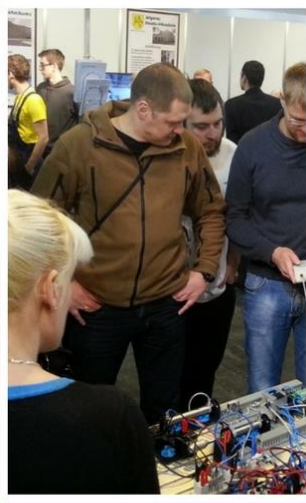
Machine Vision participants at Festo Machine Vision study stand with SBSI

Machine Vision participants (employees) visited Tech Industry 2016